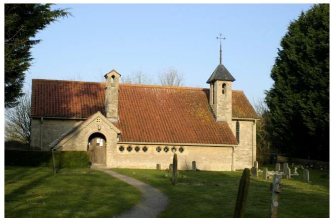
St John the Baptist, Curbridge