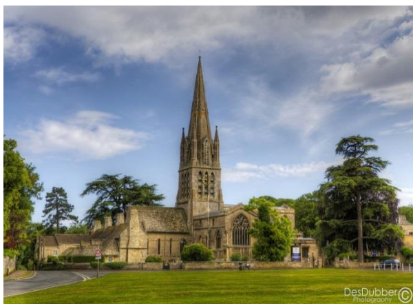
St Mary the Virgin, Witney