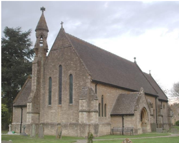
St John the Evangelist, Hailey